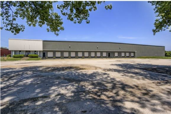
Capital Area MIS