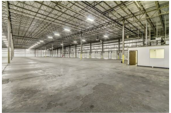
Capital Area MIS