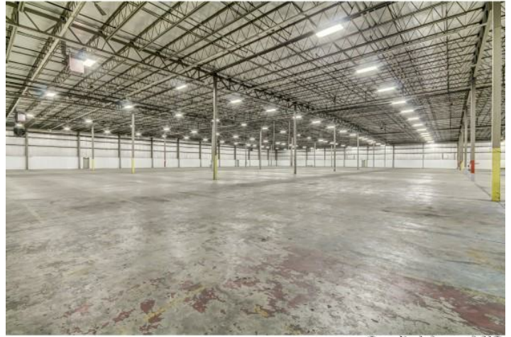
Capital Area MIS