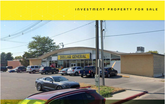
DOLLAR GENERAL 1645 10TH STREET | GERING, NEBRASKA CBRE

Gering NE: 1645 10th St - Dollar General 1645 10th Street | Gering, NE | US | Scotts Bluff County Available SF: 13,977 | Sale Price: $375,000