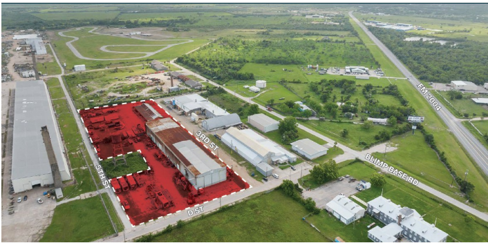
ArcGIS Web Map