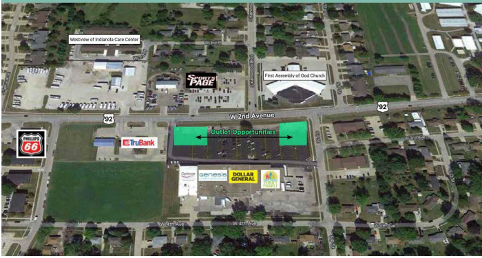
High Visibility at Newly Renovated Center