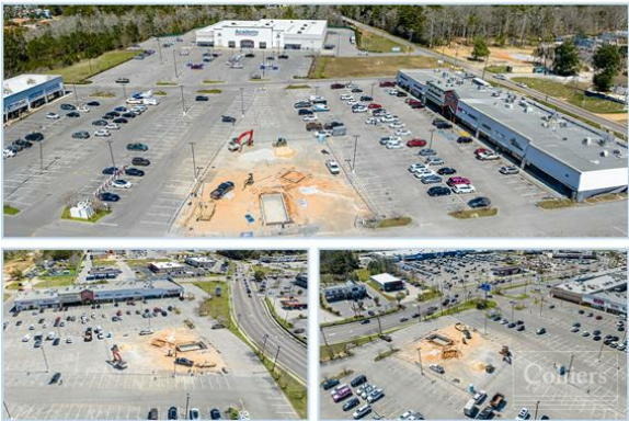
ADDITIONAL PHOTOS TAKEN MARCH 11, 2025

Sale Price: $1,241,000 Last Updated: Jun 5, 2025