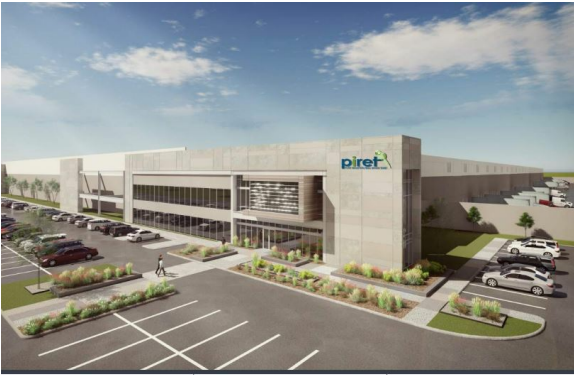
Union Pacific Rail Service Close to Union Pacific Intermodal 84.7 Acres for a Build-To-Suit 400,000 - 1,400,000 SF 50% Real Property Tax Abatement Triple Freeport